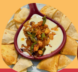
TOP SHELF DIP

SUB CORN TORTILLA CHIPS FOR FLOUR CHIPS $1.99